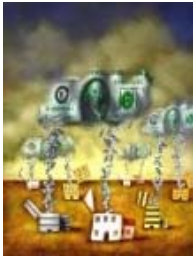
The surreal world of foreclosures.